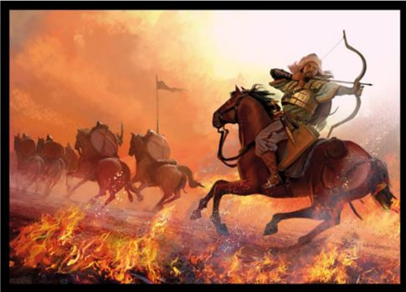
Attila of Huns “Scourge of god”